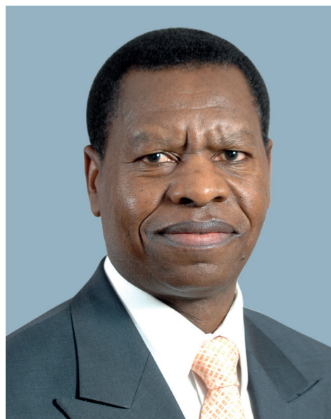
Chief Justice Peter Shivute