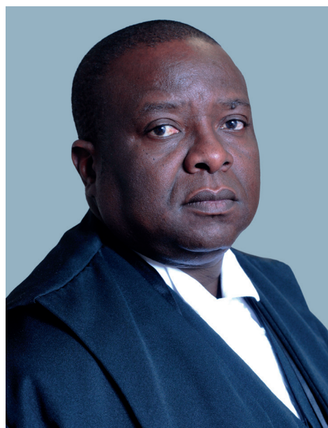
Judge President Petrus Damaseb

The judiciary includes the Supreme Court, the High Court and the Lower Courts. All the courts are independent and subject only to the Constitution and the law.