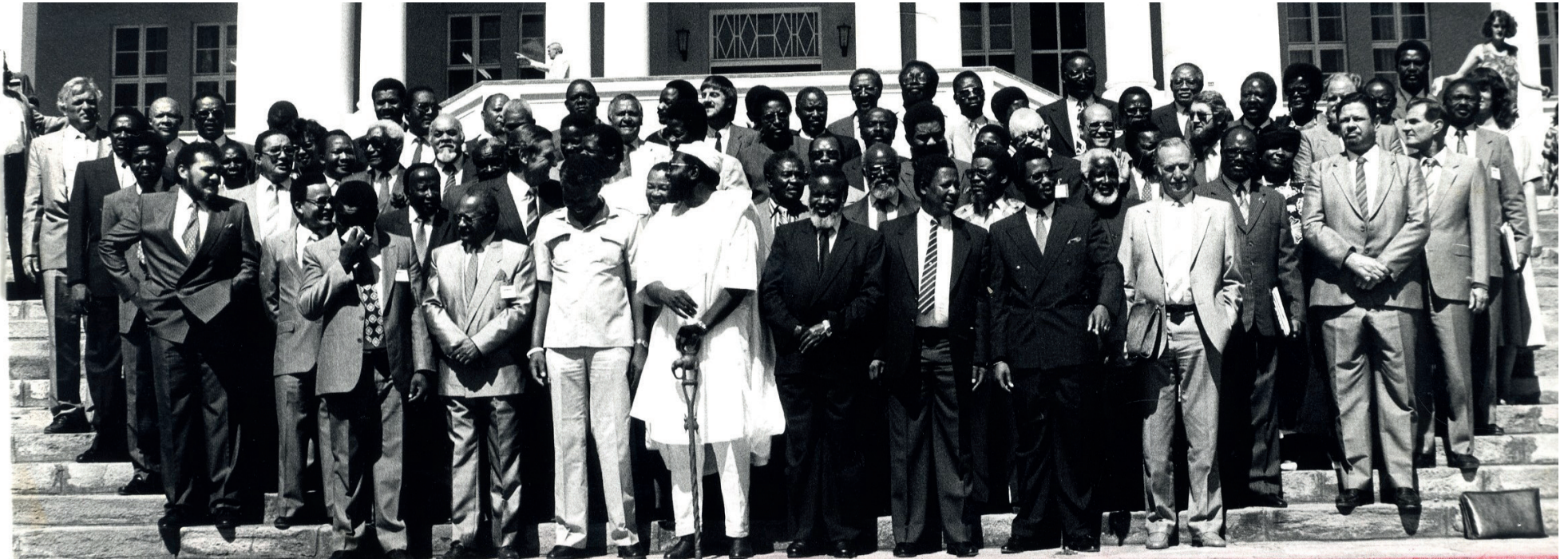
Members of the Constituent Assembly in 1990.