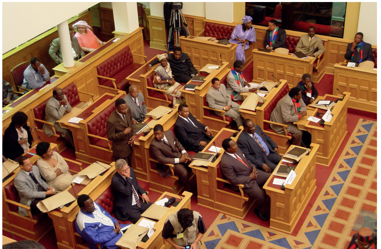
On November 28 Namibians will decide the composition of the National Assembly.

From next year Namibia will also have a Vice-President. This is because the Constitution was amended in 2014 to create this post. The President will choose a member of the National Assembly to become Vice-President. After his or her appointment the Vice-President will resign their seat in the National Assembly to be able concentrate on the vice-presidency role.